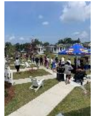
Grand Opening celebration