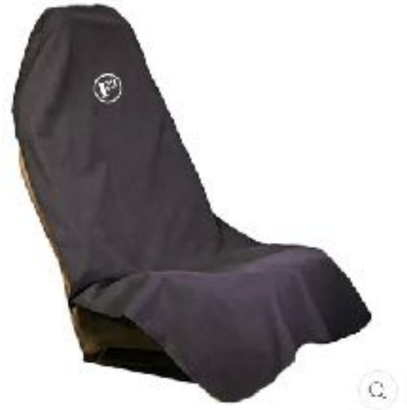
F3 ULTRASPORT SEATSHIELD - BLACK

UPDATE: Half of what we earn will go directly to support F3 Cape Fear's November Growruck event The 11th Hour in November, which will include community service initiatives throughout.